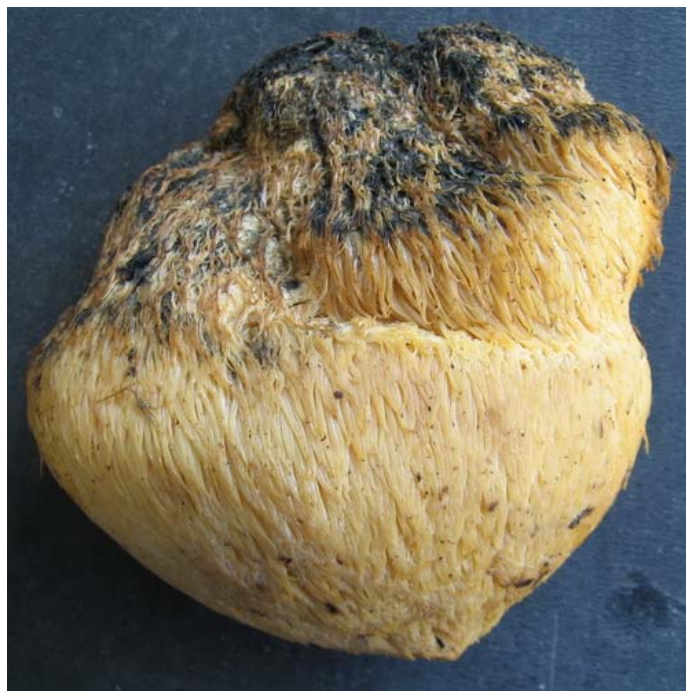
Fig. 2. Fruitbody of Hericium erinaceum .

before in Sofia Region. It is listed in the proposal for inclusion of fungi in the Appendix I of the Bern Convention (10) and on national level (9) is considered to be Endangered [EN B1ab (i,iii,iv)] and is among the fungal species chosen for monitoring within the frame of the National Biodiversity and Protected Areas Monitoring System (12). This fungus normally inhabits standing trees in old-grown forests and its occurrence in parkland and urban environment is quite unusual.