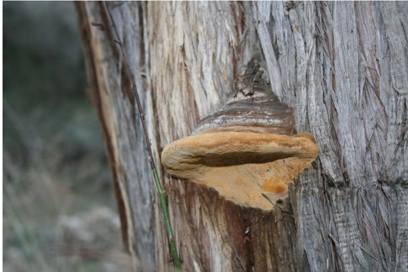
Fig. 6. Fruitbody of Pyrofomes demidoffii .

trees is situated in Tisata Nature Reserve and the other is outside the borders of the protected area.