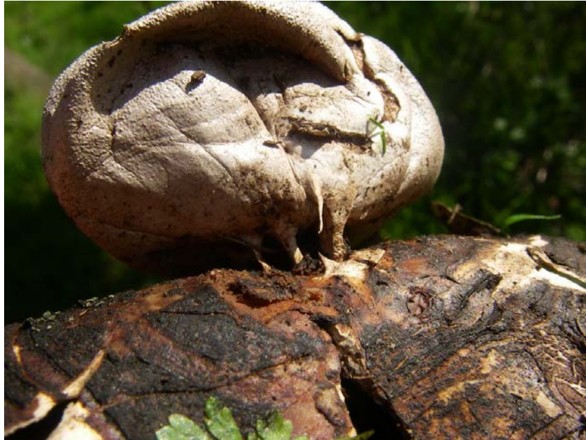
Fig. 4. Fruitbody of Myriostoma coliforme .