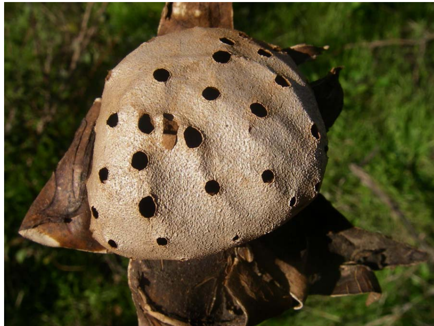
Fig. 5. Fruitbody of Myriostoma coliforme .

Pyrofomes demidoffii (Lev.) Kotl. & Pouzar Southern Valley of Struma River: Kresna Gorge (Blagoevgrad distr., Kresna municipality), at approximate coordinates 41°44'14.0"N, 23°9'19.4"E & 41°44'37.4"N, 23°9'31.0"E, FM-72, 03 May 2010, obs. R. Alexov, figs 6, 8 .