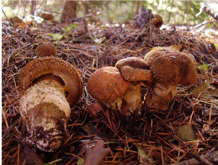
Fig. 7. Fruitbodies of Suillus lakei .