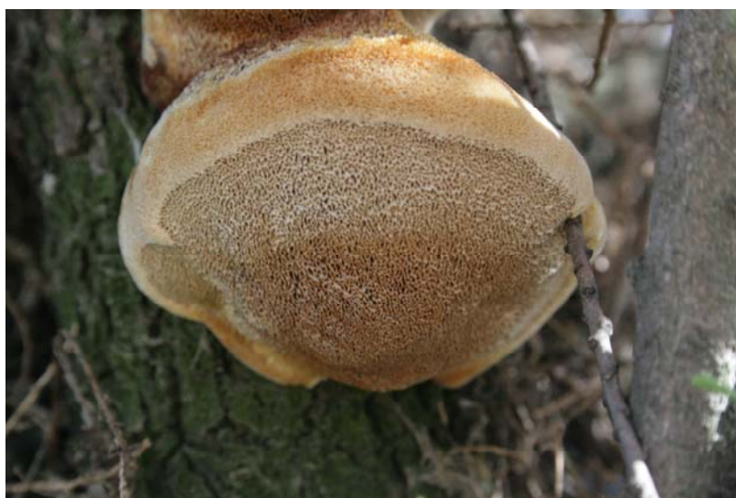
Fig. 3. Fruitbody of Inonotus tamaricis .

where it is highly threatened by the development of tourism (8). The fungus is considered to be Endangered according to the Red List of Fungi in Bulgaria (9). The new locality is situated in the immediate vicinity of agricultural land and a significant threat for the species there is the ongoing removal of tamarisk shrubs by agricultural workers. The number of fruitbodies counted in Lebnitsa village is 34. Further search might possibly reveal more localities of I. tamaricis in the southern parts of the Valley of River Struma, where tamarisk is relatively often seen along the riverbanks or planted on road embankments.