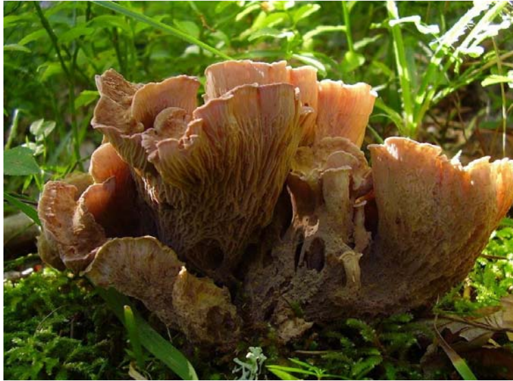
Fig. 1. Fruitbodies of Gomphus clavatus .